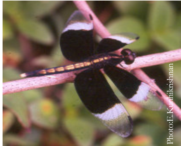
Pied Paddy Skimmer - male

Wings: Basal half is opaque blue black which is bordered by a milky white patch towards the tip. The wing tips are transparent. Wing spot: Dull brown. Abdomen: Black with a broad middorsal creamy white stripe on the upperside. Female: Differs significantly from the male in body markings and colouration. The face is olivaceous yellow. Eyes: Pale brown above, which fade to pale olivaceous towards the sides and below. Thorax: Greenish yellow with a bright yellow mid dorsal stripe. This stripe is broadly bordered with blackish brown throughout. Legs: The outer surface of legs is yellow and the inner surface is black. Wings: Base of the wings bright amber yellow. Front edge of the wing is blackish brown, broadening into a very large blackish brown spot. This spot extend to the rear edge of the wing. In hindwings this spot is irregular or sickle shaped. Tips of all wings are broadly blackish brown. Wing spot: Dull brown. Abdomen: Bright yellow with a broad black band above. Underside is black. Habits and habitat: A conspicuous species of ponds, marshes and paddy fields. Flight is slow and weak. Usually perches on twigs, aquatic weeds and other plants. This species is very common along irrigation canals in paddy fields. Breeding: Breeds in marshes and ponds. Flight season: Found throughout the year. However, peak abundance is during July-September months. Distribution: Throughout the Oriental region.