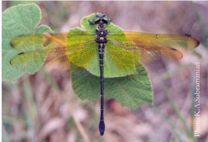
Nilgiri Mountain Hawk

Mountain Hawks are large black or dark brown dragonflies with bright yellow markings. The eyes are large and they are moderately separated or meet at a point. The wings are transparent or tinted with golden yellow. The abdomen is cylindrical in both sexes or compressed in females. Mountain Hawks are forest species and they fly