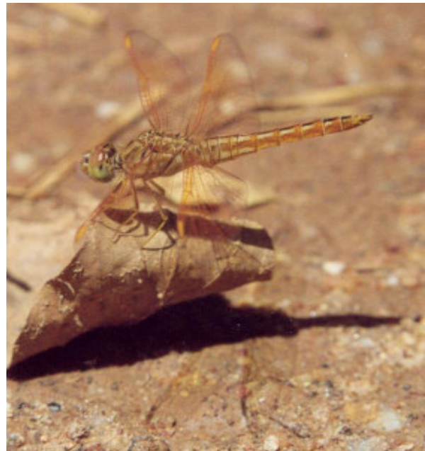
Ditch Jewel - female

Female: Face is yellowish white. Eyes: Pale brown above and bluish grey below. Thorax: Pale greenish-yellow, with a narrow brown middorsal stripe. A dark brown lateral stripe is also present. Legs: Similar to that of the males. Wings: Transparent. The bright orange wing patches of males absent. The hindwing tinted with yellow at the base. Wing spot: Rusty. Abdomen: Pale olivaceous-brown with a black middorsal stripe. In segments 2-6 a subdorsal brown stripe borders the middorsal stripe, enclosing a yellow area.