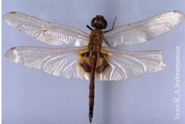
Red Marsh Trotter - male

Habits and habitat: Marshes and ponds. Breeding: Breeds in marshes and ponds. Flight season: Not known. Distribution: Oriental region.