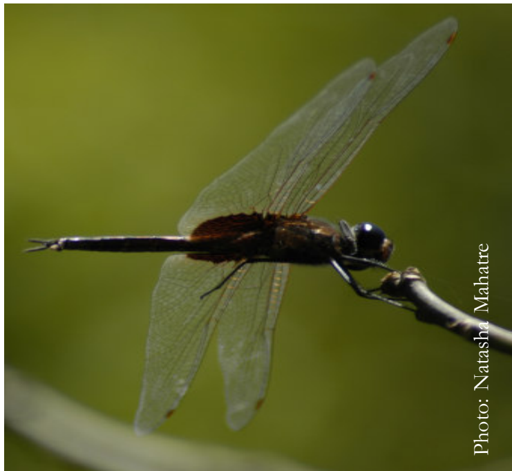
Black Marsh Trotter