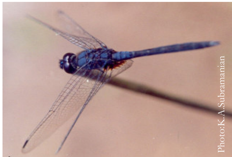
Black Stream Glider - male

Wings: Transparent, with a dark opaque brown mark at the base of hindwing. Wing spot: Black. Abdomen: Black covered with fine blue pruinescence. Female: Face is dirty brown in front and changes to brown above. Eyes: Dark brown above and grey below. Thorax: Greenish yellow to olivaceous. A medial and lateral dark brown stripe is present. In addition to this,