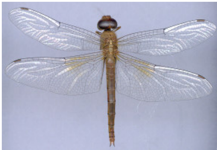
Coral-tailed Cloud Wing - female