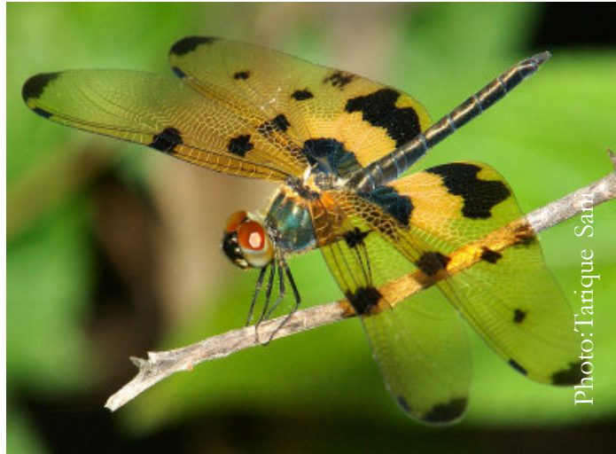
Common Picture Wing - male

Description: A medium sized dragonfly with butterfly like yellow and brown wings. Male: Frons iridescent green. Eyes: Dark reddish brown above. Thorax: Iridescent green. Legs: Black. Wings: The forewing is transparent and golden yellow. The wing tip, leading edge and centre of the wing are marked with deep coffee brown spots. The hindwing also has similar spots; however the central spot is absent. More over, the wing base is marked with an irregular brown patch. The trailing edge of the hindwing has a characteristic 'W' shaped coffee brown mark. Wing spot: Black. Abdomen: Black. Female: Wings: Tips of