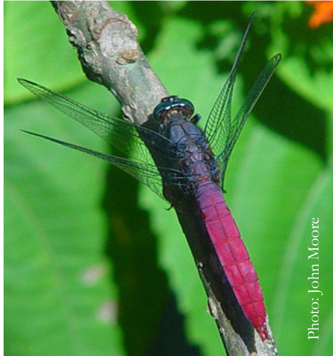
Crimson-tailed Marsh Hawk - male

Breeding: Breeds in puddles, ponds and tanks. Flight season: Throughout the year. Distribution: Oriental region.