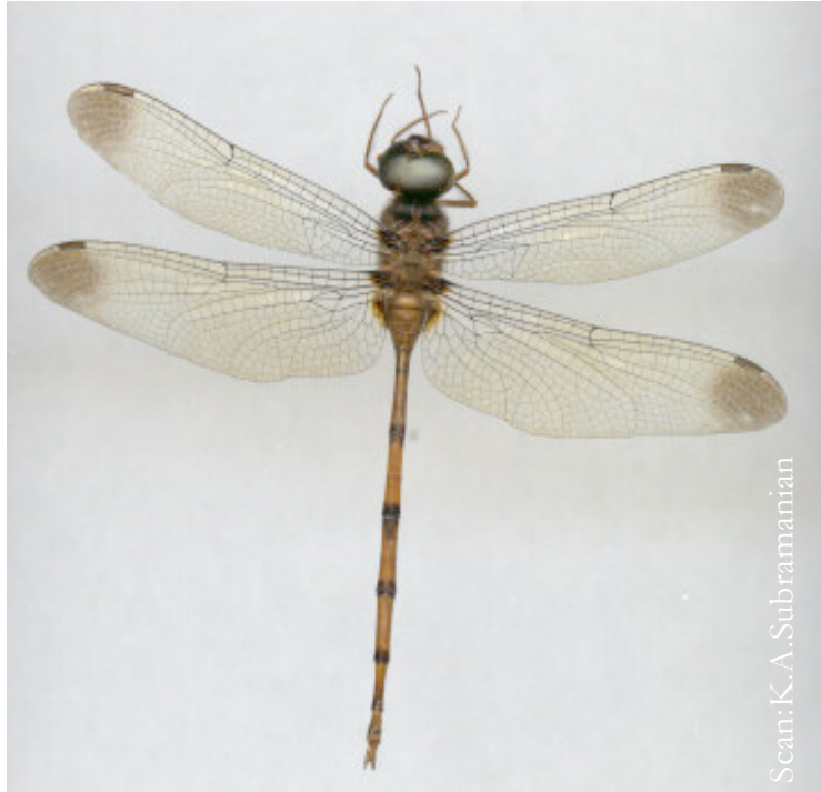
Brown Dusk Hawk