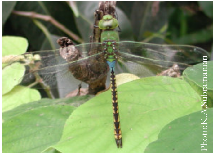
Blue-tailed Green Darner

Breeding: Breeds in marshes. Flight season: May-November. Distribution: Throughout the Oriental region and occurs up to an altitude of 1800m (ASL) in the Western Ghats.