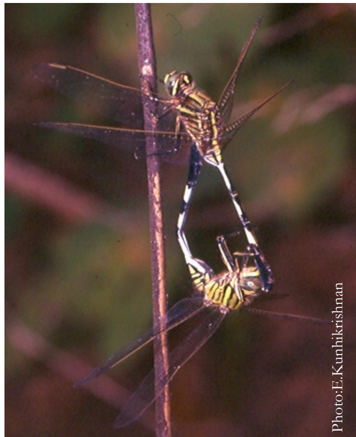
Green Marsh Hawk