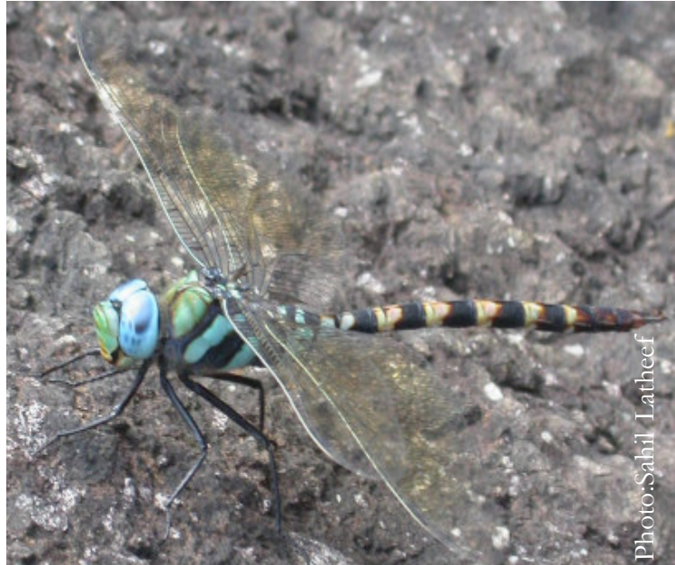
Blue Darner - male

Flight season: Not known. Distribution: Oriental region.