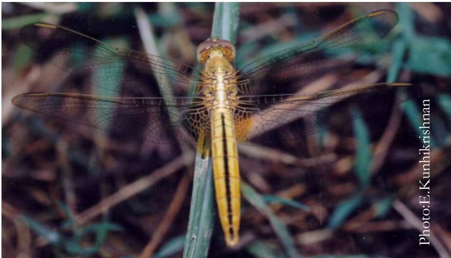
Ruddy Marsh Skimmer - female