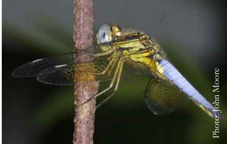
Blue-tailed Yellow Skimmer

Thorax: Pale greenish yellow. Dorsal side is warm reddish brown. Legs: