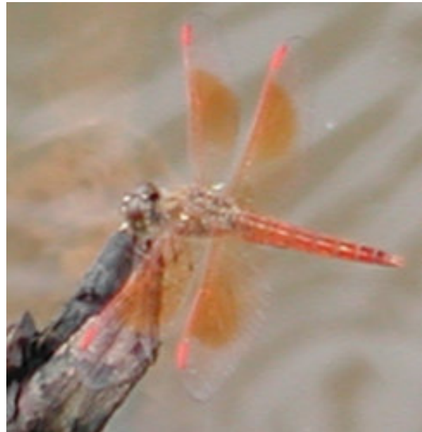
Ditch Jewel - male

Description: Male: Face is olivaceous. Eyes: Olivaceous brown above bluish grey below. Thorax: Olivaceous brown to reddish brown above with two reddish brown lateral stripes. Legs: Dark brown in colour. Wings: Transparent with reddish venation. A broad bright orange patch extending from wing base to wing spot is present in fore and hind wings. Wing spot: Rusty. Abdomen: Bright red.