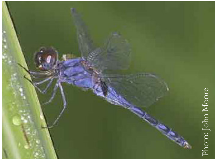
Black Stream Glider - male

Description: Male: Frons is dark brown in front and iridescent violet above. Eyes: Dark brown above with a purple tinge. It is bluish grey laterally and beneath. Thorax: Black, covered with purple pruinescence. This gives a deep blue appearance. Legs: Black.