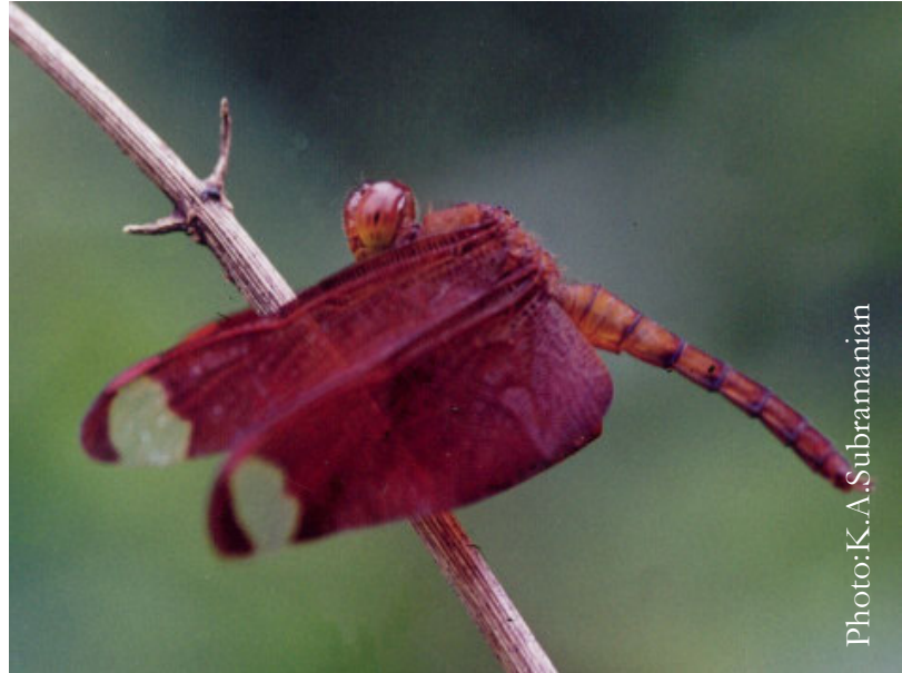
Fulvous Forest Skimmer - male

Skimmers are the most diverse group of odonates. They are large, medium or small dragonflies and non-iridescently coloured. Eyes are always broadly confluent. The wings vary in size, shape, width and colouration. This family has worldwide distribution and is represented by 1139 species. They breed in wide variety of aquatic habitats like puddles, ponds, marshes, rivers, domestic storage tanks and aquaria. Within Indian limits, 95 species are known, of which 50 species are found in the peninsular India.