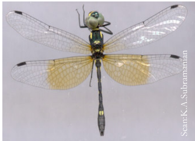
Pigmy Skimmer dorsal view