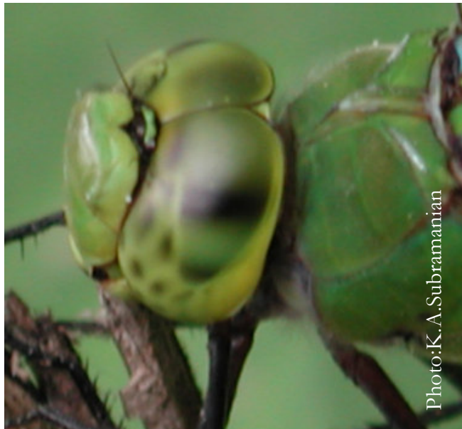
Blue-tailed Green Darner