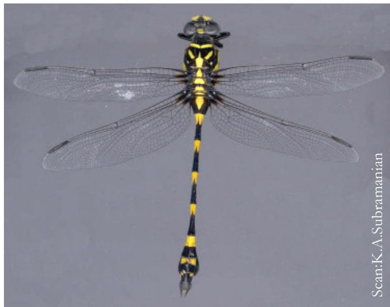
Common Clubtail seen from above

segment 8. Female: The female is very similar to the male. The yellow markings are more extensive. Abdomen stouter, laterally compressed and short. Habits and habitat: This common dragonfly usually perches on a bare twig facing the water. Commonly found in ponds, tanks and rivers. Breeding: Breeds both in running and still waters; more frequently in the latter. Pairing takes place over water. Female deposits eggs by quick dipping abdomen over water. Flight season: Throughout the year. Distribution: Throughout Oriental region.