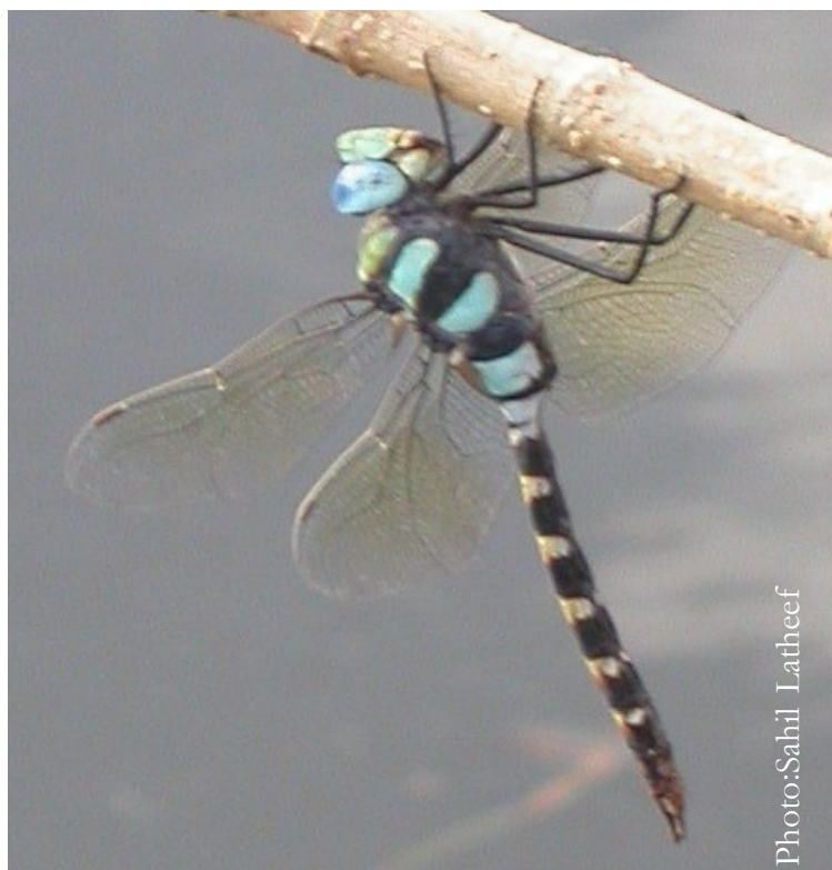
Blue Darner - male