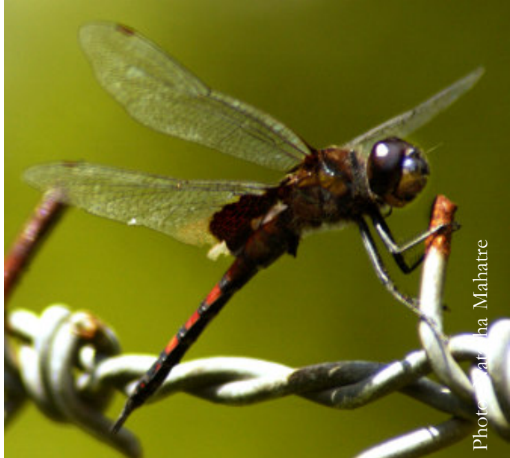
Black Marsh Trotter

Breeds in ponds, marshes and tanks. Flight season: Throughout the year. Distribution: Widely distributed in Ethiopian and Oriental region.