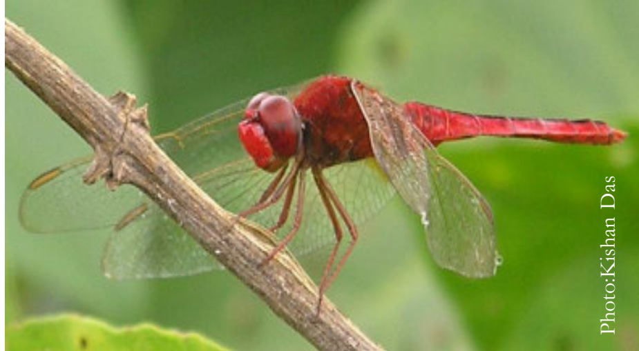
Ruddy Marsh Skimmer - male

Distribution: Widely distributed in Oriental and Australian region.