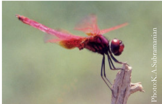
Crimson Marsh Glider - male