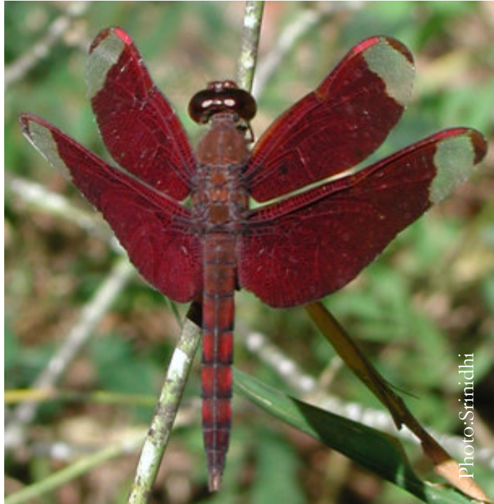
Fulvous Forest Skimmer - male

Description: A medium sized rusty coloured dragonfly with transparent wing tips. Male: Face is reddish brown. Eyes: Dark reddish brown above, golden brown below. Thorax: Reddish brown. Legs: Dark reddish brown. Wings: Opaque dark reddish brown with an irregular triangular transparent area at the tip of the wing. Wing spot: Dark reddish brown. Abdomen: Reddish brown. Female: Many forms of females are found. Colour of head, thorax and abdomen paler than males or rusty brown. Wings are clear amber yellow with a dark ray extending to the tip in fore wing. Habits and habitat: A dragonfly of wet forests. Usually perches on fallen logs and shrubs. A large number of them can be found together in canopy gaps and forest edges. Breeding: Breeds in marshes associated with forest streams and rivers. Flight season: Found throughout the year. However, large number can be seen between May-September. Distribution: Forested areas of Oriental region.