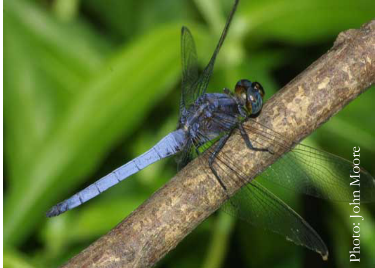
Blue Marsh Hawk - male

Distribution: Widely distributed in the Oriental region.