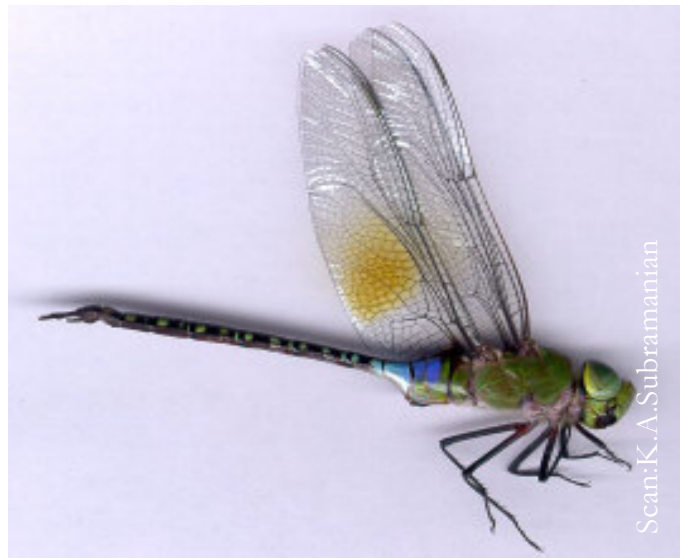
Blue-tailed Green Darner