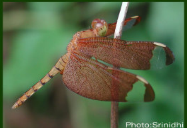
Mountain Hawks (Corduligasteridae) Page-46