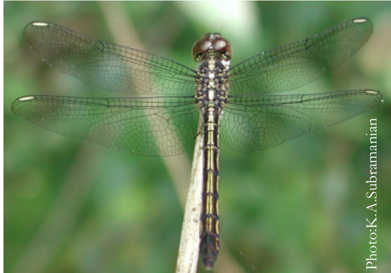
Emerald-banded Skimmer seen from above

Breeding: Breeds in marshes associated with hill streams. Flight season: May-November. Distribution: Forested areas of Oriental region.