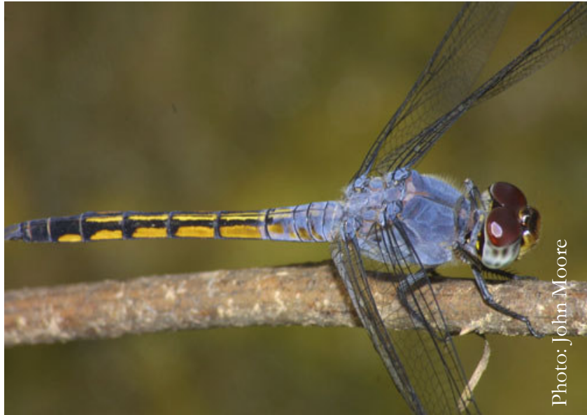
Yellow-tailed Ashy Skimmer - male

Description: A medium sized dragonfly with bluish black thorax and yellow tail with black markings. Male: Face is olivaceous yellow to steel black or brown. Eyes: Reddish brown above and bluish grey below. Thorax: Black in adults and covered with bluish pruinescence. In young adults, yellow