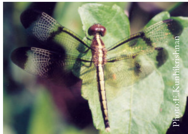
Pied Paddy Skimmer - female