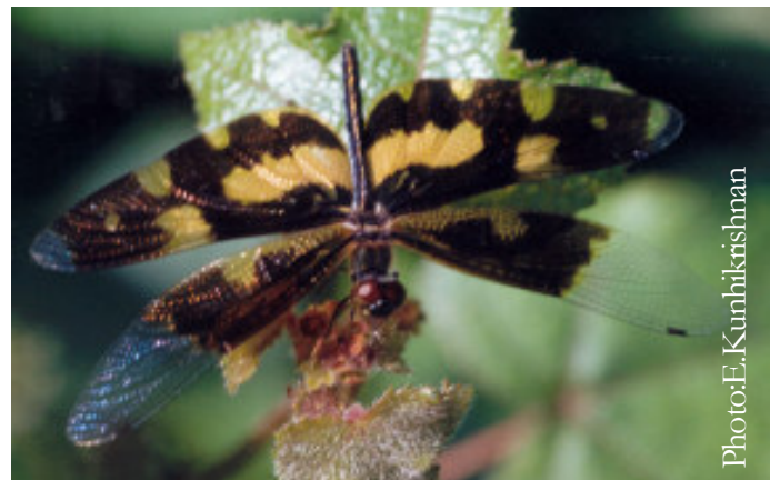
Common Picture Wing - female

the forewings is transparent. A dark brown opaque area extends to the centre of fore wing. This area borders a bright yellow hockey stick shaped patch. In hindwings the brown opaque area is more extensive and reaches upto the wing tip, which encloses a long yellow central patch and a small yellow spot towards the wing tip. This patch also borders yellow spots of wing margins. Wing spot: Black. Abdomen: Bluish black. Habits and habitat: A prominent dragonfly of marshes, paddy fields and ponds. This species is easily mistaken for a butterfly. A weak flier and frequently perches on aquatic weeds. This dragonfly is rarely seen away from water. Breeding: Breeds in marshes, ponds and paddy fields. Flight season: Throughout the year, especially near perennial marshes. Distribution: Throughout the Oriental region.