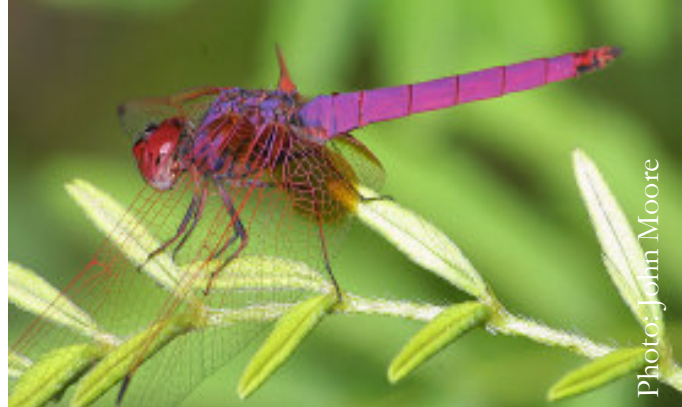
Crimson Marsh Glider - male

Description: Male: Face is redish brown changing to reddish above. Eyes: Crimson above and brown on sides. Thorax: Red with fine dull purple pruinescence. Legs: Black. Wings: Transparent with crimson venation. Base of the wings has a broad amber patch. Wing spot: Dark reddish brown. Abdomen: Crimson with a violet tinge. The base of abdomen is swollen. Female: Face is olivaceous or bright redish brown. Eyes: Purplish brown above and grey below. Thorax: Olivaceous with brown median and black lateral stripes. Legs: Dark grey with narrow yellow stripes. Wings: Transparent with brown tips. The venation is bright yellow to brown and basal amber markings are pale. Wing spot: Dark brown. Abdomen: Redish brown with median and lateral black markings. The black markings are confluent at the end of each segment and enclose an redish brown spot. Habits and habitat: One of the common dragonflies of wetlands. The males usually perch on dry twigs, aquatic plants and over head cables. Breeding: Breeds in streams, rivers, canals, ponds and tanks. Flight season: Throughout the year. Distribution: Oriental region.