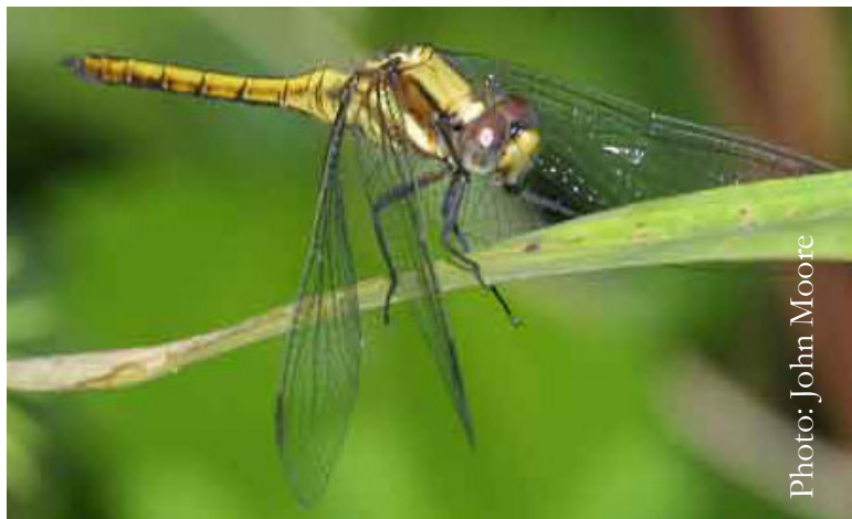
Blue Marsh Hawk - female