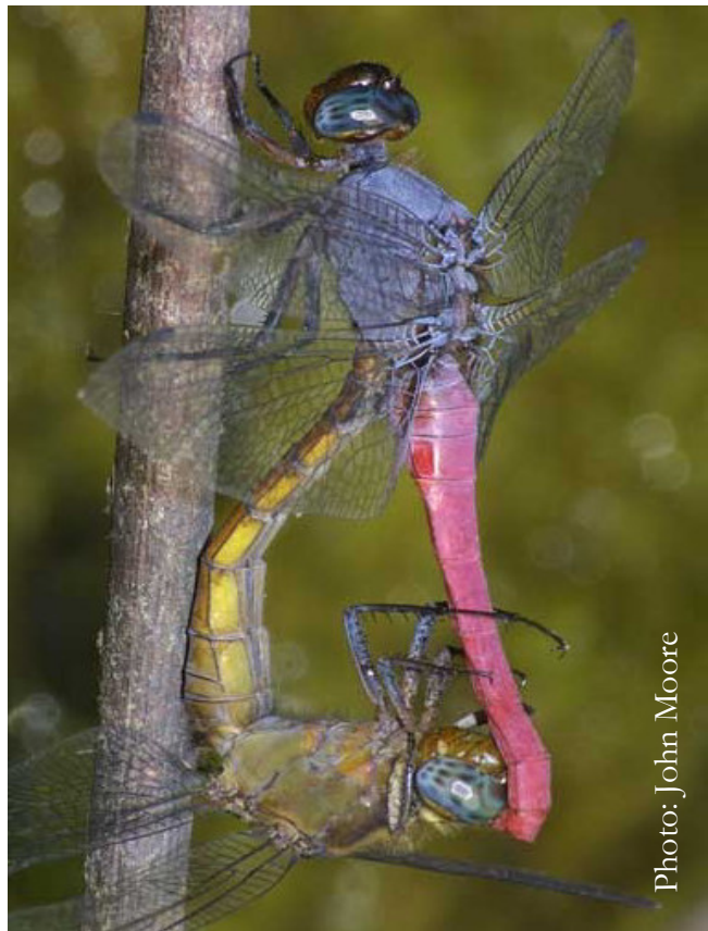
Crimson-tailed Marsh Hawks - mating