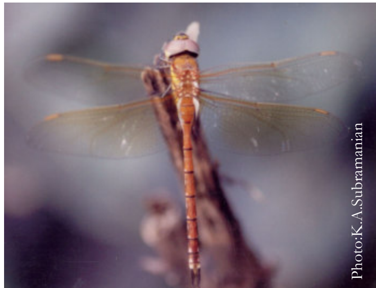
Rusty Darner seen from above