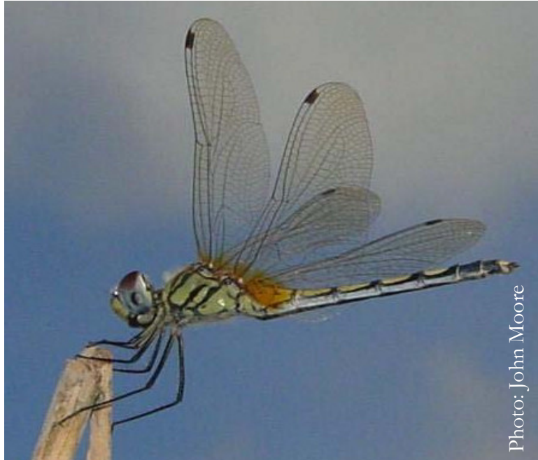
Long-legged Marsh Glider

Description: A medium sized yellowish brown dragonfly with long spider like legs. Male: Face is yellow or pale brown in front and iridescent purple above. Eyes: Reddish brown above, brown on sides and bluish grey below. Thorax: Olivaceous-brown above with a dark brown triangle. On sides, it is bright yellowish brown with three black stripes on each side.