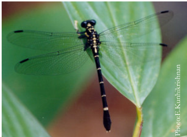
Syrandiri Clubtail seen from above