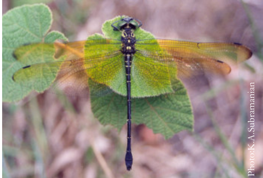
Nilgiri Mountain Hawk

basal segments and outer side of anterior femora yellow. Wings: Transparent with tips dark brown. Wing spot: Black and narrow. Abdomen: Black with yellow markings. The first segment has a small dorsal spot. Second segment has a complete yellow apical ring and a pair of dorsal crescent marks. Segment 4-7 with narrow paired dorsal yellow crescent marks and the remaining segments are black. Female: The colour and markings of body very similar to male. Wings: Transparent and tinted with rich golden yellow. The wing tips are diffusely tipped with blackish-brown. Habits and habitat: Confined to high altitude forests. Usually soars above forest canopies descending occasionally to forest clearings. Breeding: Breeds in torrential streams. Flight season: April-September. Distribution: Restricted to the Western Ghats above 1200m in the region between Nilgiris and Kodagu.