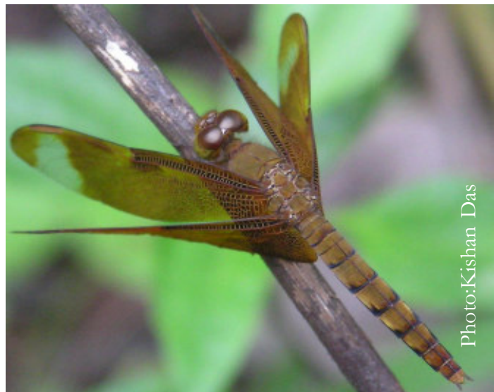
Fulvous Forest Skimmer - female