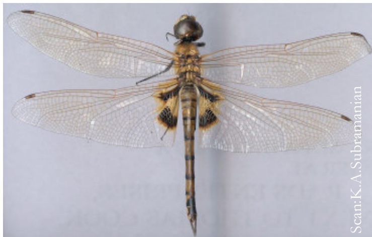
Red Marsh Trotter - female